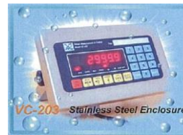
Stainless Steel Enclosure